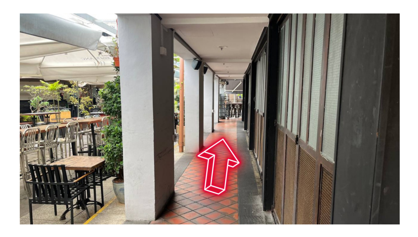
Turn right once you reach the end of the corridor and enter via the first door (S31)